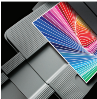
full color printer/copier/scanner/fax